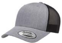
HEATHER/BLACK Cool Grey 9C/ Black 6C