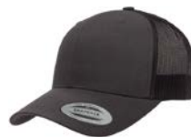
CHARCOAL/ CHARCOAL Cool Grey 11C/ Cool Grey 11C