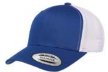
ROYAL/WHITE 7687C/No PMS