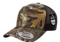
REALTREE EDGE®***/ BROWN No PMS/2479C