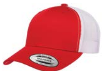
RED/WHITE 200C/No PMS