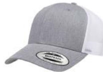
HEATHER/WHITE Cool Grey 9C/ No PMS