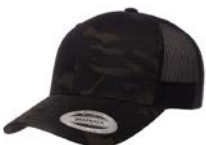
MULTICAM® BLACK*/ BLACK No PMS/Black 6C