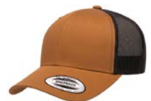
CARAMEL/Black 730C/ Black 6C