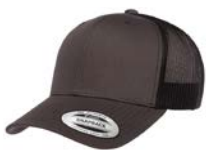
CHARCOAL/BLACK Cool Grey 11C/Black 6C