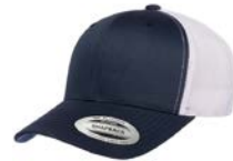
NAVY/WHITE 533C/No PMS