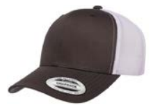
CHARCOAL/WHITE Cool Grey 11C/ No PMS