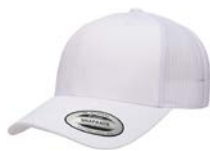
WHITE/WHITE No PMS/No PMS