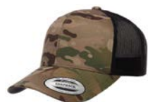
MULTICAM®*/BLACK No PMS/Black 6C