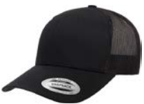
BLACK/BLACK Black 6C/Black 6C

Textile fabric colours are subject to dye lot variation and will not be exact match to print pantone reference