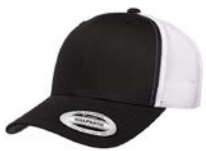
BLACK/WHITE Black 6C/No PMS