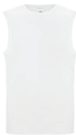
WHITE No PMS