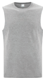
ATHLETIC HEATHER* Cool Grey 5C