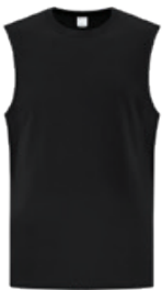
BLACK Black 6C

Textile fabric colours are subject to dye lot variation and will not be exact match to print pantone reference