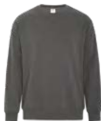
PEWTER Black 7C