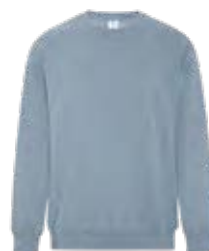
STONE BLUE 2157C