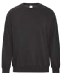
BLACK Black 6C

Textile fabric colours are subject to dye lot variation and will not be exact match to print pantone reference